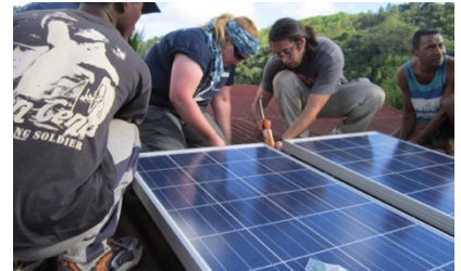
Installing solar panels at a school in Kianjavato, Madagascar (May 2012).